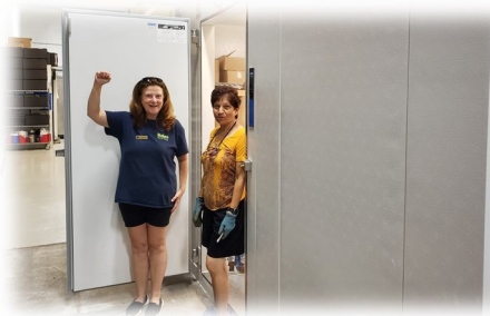
New freezer purchased through a grant by Eden Food for Change.

2020 has been a very busy and challenging year – it has been a privilege to help our community as it faces one of the most challenging crises that our world has seen. But the year is not over, and you can help. Consider supporting our Mississauga Emergency Relief Fund so that we can continue to support vital programs in Mississauga as they rebuild and recover.