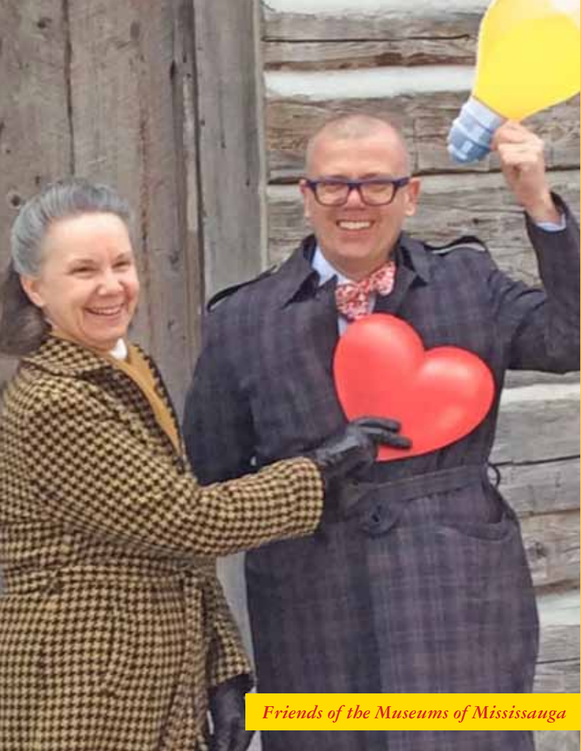
Friends of the Museums of Mississauga

For more than a decade the Community Foundation of Mississauga has been a true community champion, embodying all that it means to be smart and caring. Their vision for Mississauga leading up to 2017, and beyond, is inspiring and I know the impact of their work will be felt and talked about for generations to come.