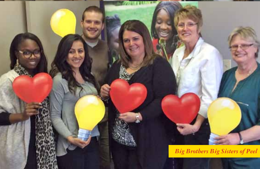
Big Brothers Big Sisters of Peel