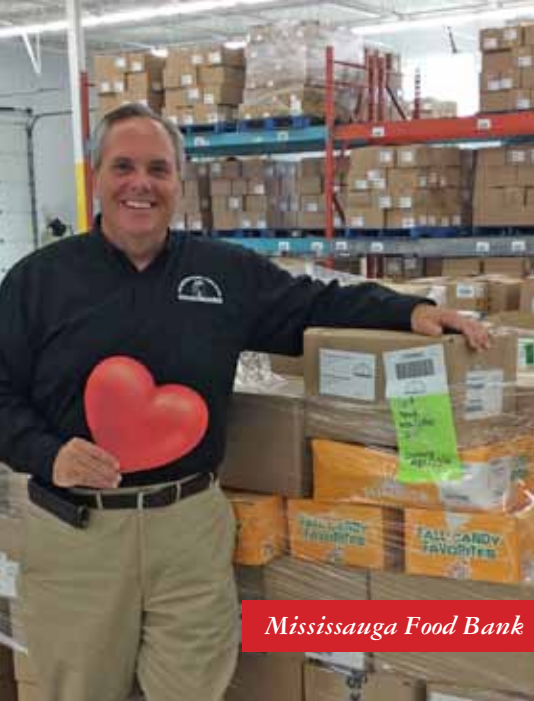
Mississauga Food Bank