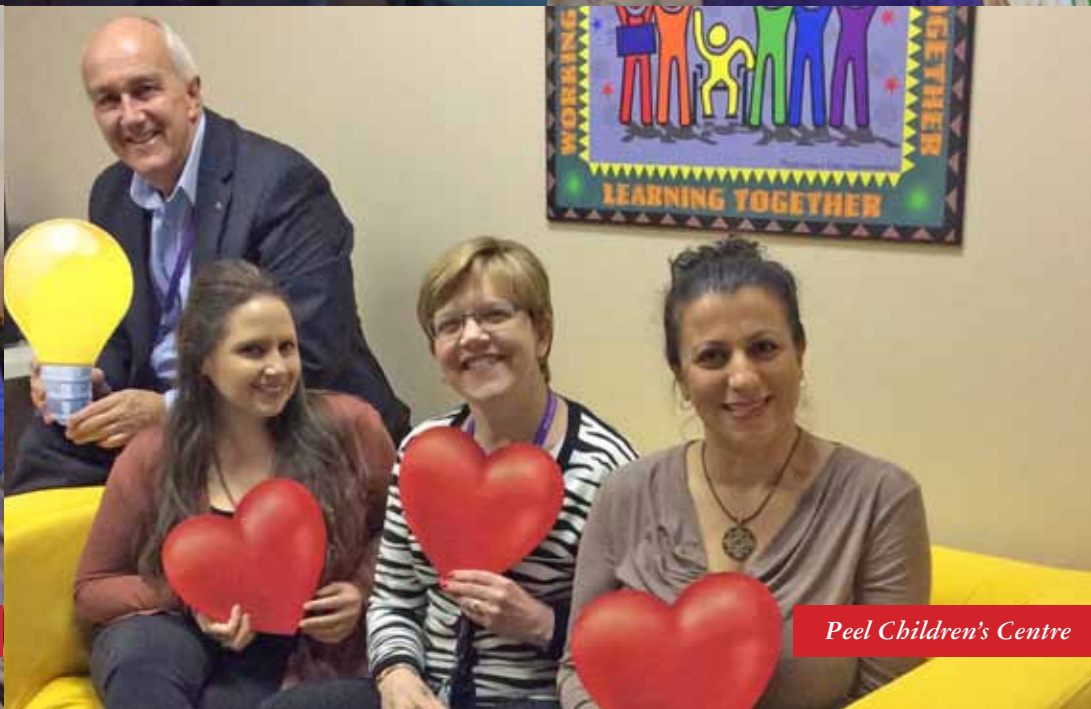
Peel Children's Centre