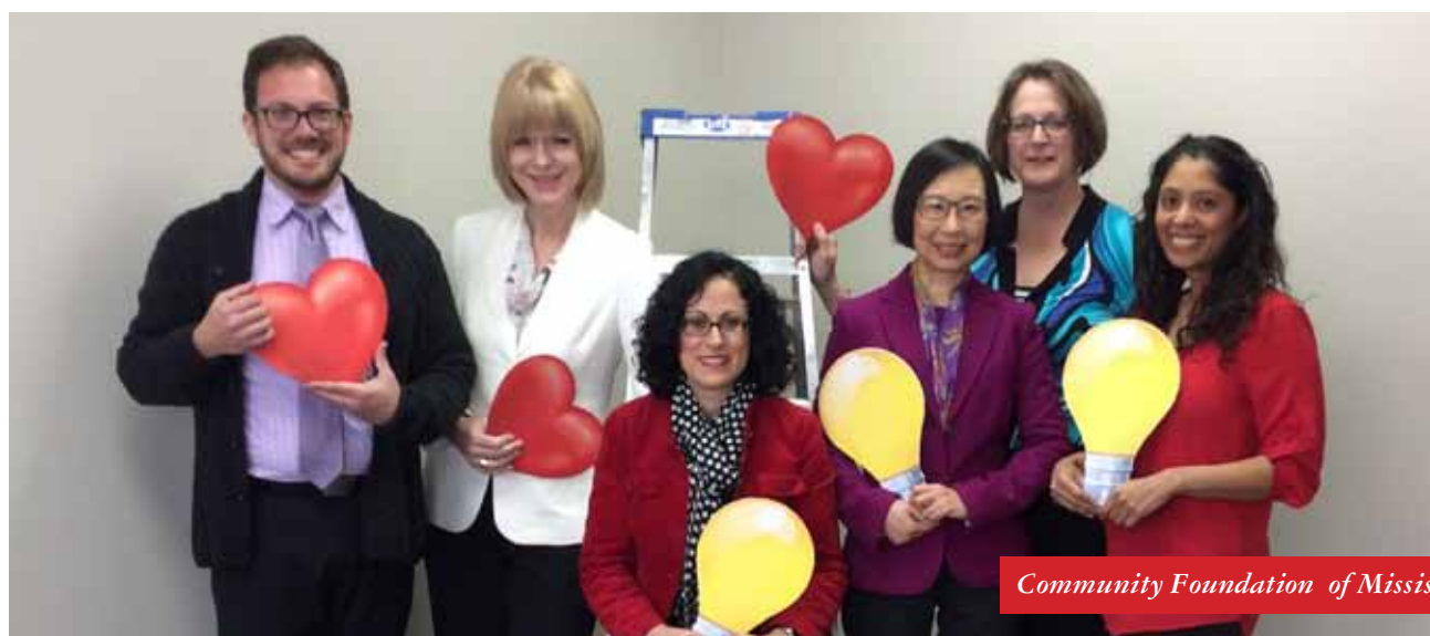
Community Foundation of Mississauga Staff

The complete Financial Statements for the year ended December 31, 2014 have been audited by Bazar McBean LLP, Chartered Professional Accountants and are available on request from the Foundation.