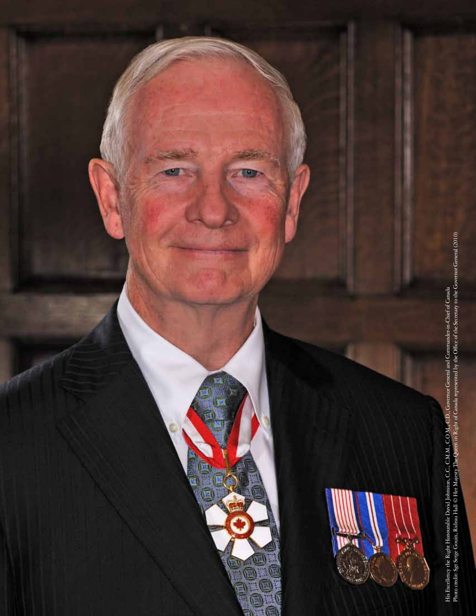
His Excellency the Right Honourable David Johnston, C.C., C.M.M., C.O.M., C.D., Governor General and Commander-in-Chief of Canada