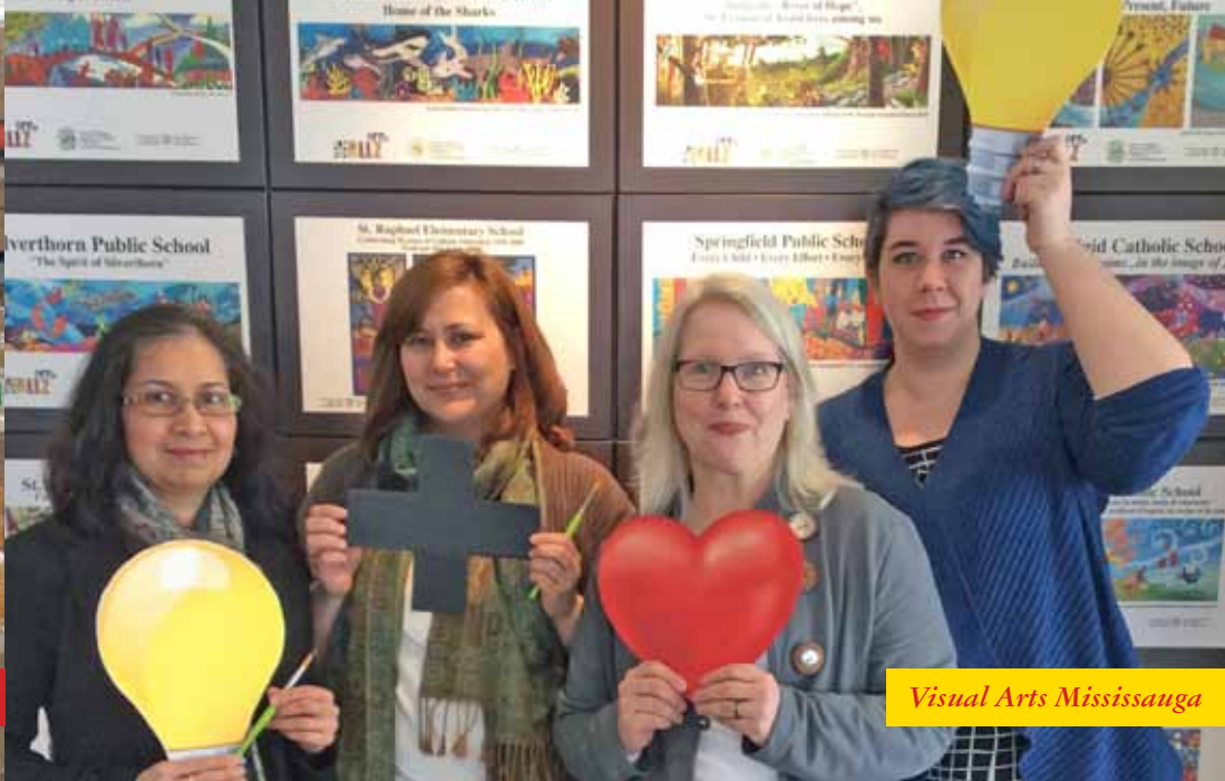
Visual Arts Mississauga