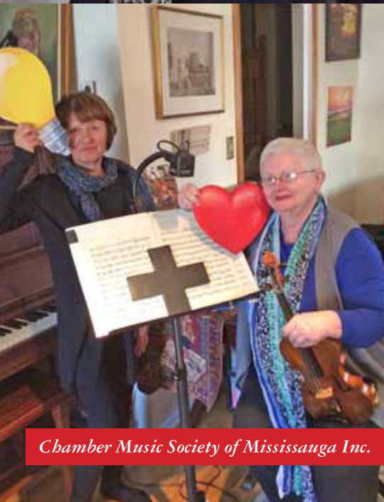
Chamber Music Society of Mississauga Inc.